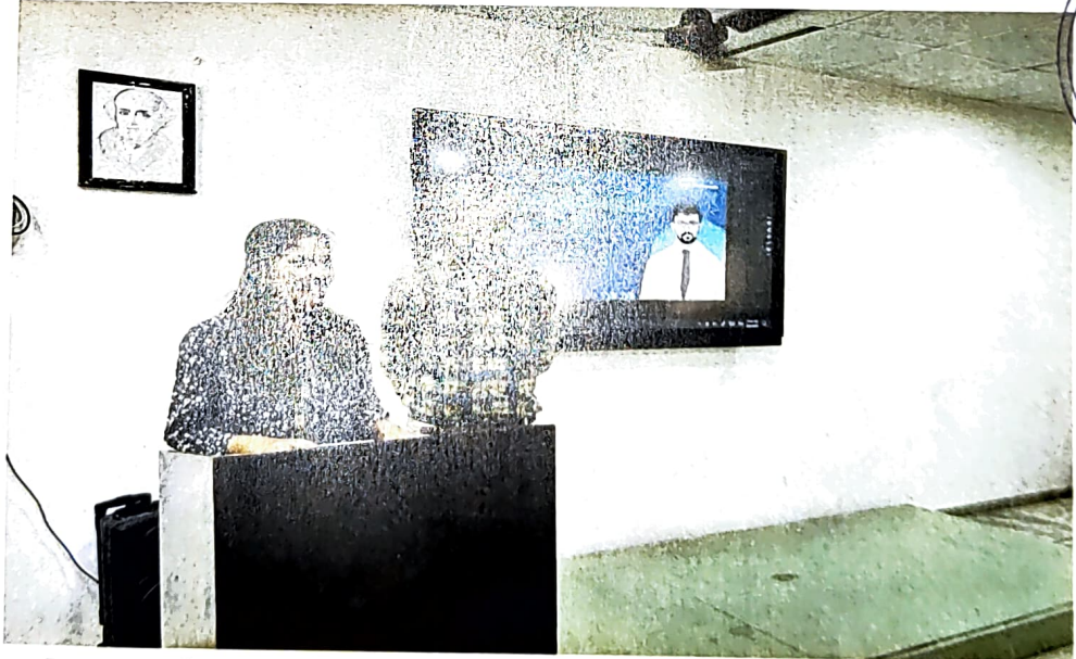
Presentation ended with Vote of Thanks by LR CR of 4th BHMS

Felicitation was given after ending the session with memento and certificate to the speaker by our principal and faculties.