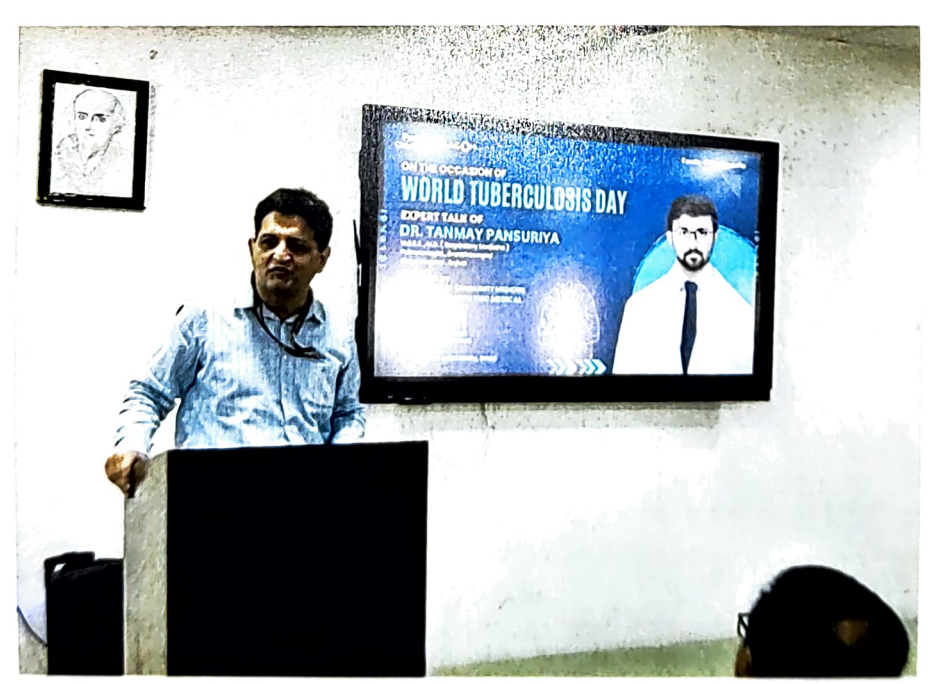
our principal sir giving welcome speech and introducing tuberculosis to us